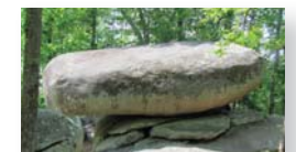
Shaking Rock Park