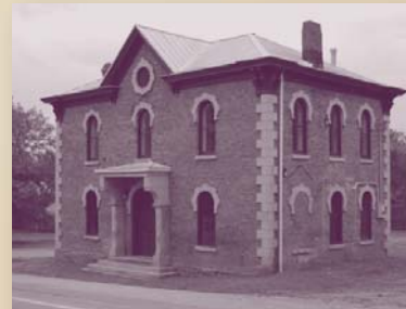
Historic Oglethorpe County Jailhouse

Enjoy a self-guided walking tour through the historic streets of Lexington. Ticket holders will be provided a walking tour brochure which includes a map and description of the houses and structures around town. Take time to visit the Lexington Presbyterian Church